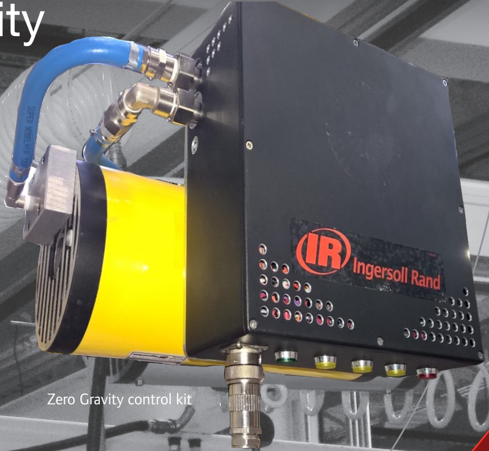
Zero Gravity control kit